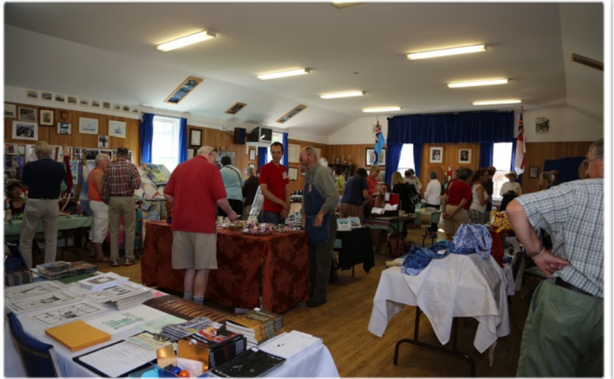
The Elizabeth Bishop Festival Market

The EBSNS was formed in 1994 to celebrate the life and work of the poet Elizabeth Bishop. The society seeks through its various activities and projects, to promote the appreciation and study of Elizabeth Bishop as a Nova Scotian writer. The EBSNS publishes an annual newsletter and holds its AGM in Great Village in June of each year. For more information about EBSNS and about membership, visit our website http://www.elizabethbishopns.org . You can also find more information about Elizabeth Bishop on the EBSNS blog www.elizabethbishopcentenary.blogspot.com . You can also visit our Facebook page "The Elizabeth Bishop Society of Nova Scotia" https://www.facebook.com/EBSofNS