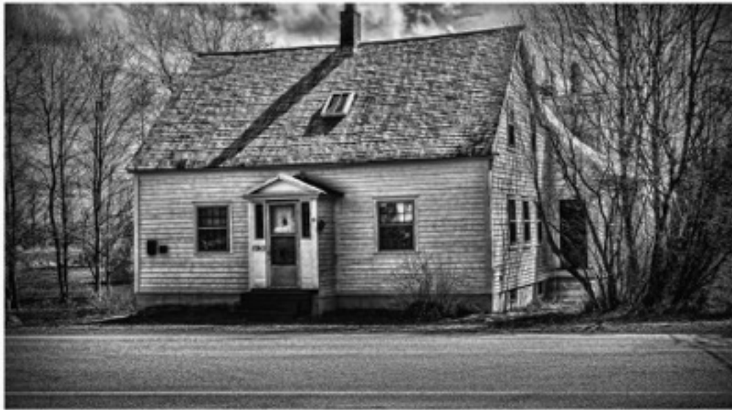
“A Poet’s Home By The Side Of The Road”

It was a very quiet year for the EB House. We had a grand total of 6 people who came and enjoyed our little house for a week at a time.